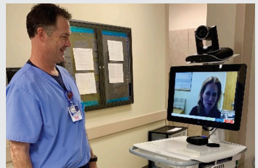
ED physician having a psychiatry consult via an American Well cart.